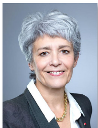
Claudie Haigneré , Senior Advisor to the Director-General of the European Space Agency (ESA)

Ms Haigneré was selected by the French National Centre for Space Studies (CNES) in 1985 as an astronaut candidate. She trained in Star City Russia, and completed her first space mission (16 days) on board the Mir Space Station in 1996. She became a member of the European Astronaut Corps for the European Space Agency (ESA) in 1999 and completed a second mission (10 days) on board the International Space Station (ISS) in 2001. From 2002 to 2004, Ms Haigneré was