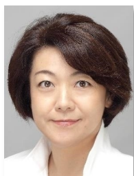
Aiko Shimajiri , Special Advisor to the Minister, Cabinet Office, Government of Japan

Ms Shimajiri was appointed in August 2016 as Special Advisor to the Minister, Cabinet Office. Prior to her current position, she held various positions including: Minister of State for Science and Technology Policy (Minister of State for Okinawa and Northern Territories Affairs, Minister of State for Space Policy, Minister in charge of Information Technology Policy) (2015); Chairperson, Federation of Okinawa Prefecture, Liberal Democratic Party of Japan Branches (2015); Chairperson, Committee on Environment of the Upper House (2014); Parliamentary Vice-Ministers of Cabinet Office (2012-2013); Director, Women’s Affairs Division, Liberal Democratic Party of Japan (2011). Ms Shimajiri studied at Sophia University, faculty of humanity.