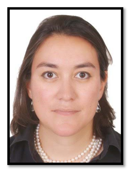
Head Office of Legal Counsel, Nuclear Energy Agency