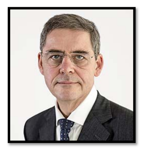
Partner Freshfields Bruckhaus Deringer, United Kingdom

Programme Leader International School of Nuclear Law