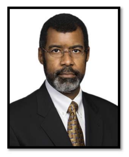
Director-General Nuclear Energy Agency