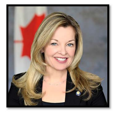
Senior General Counsel Canadian Nuclear Safety Commission