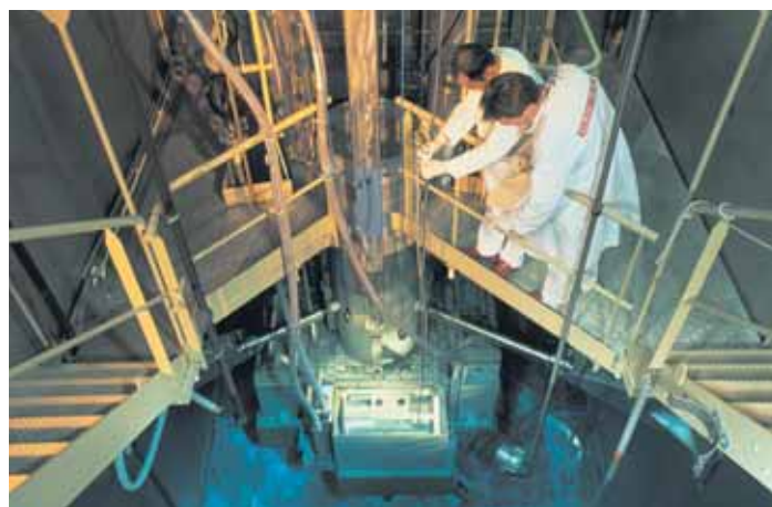
P. Stroppa, CEA, France

Two reports on the use of burn-up credit in nuclear fuel cycle operations were published. They relate to mixed-uranium and plutonium-oxide (MOX) fuels, irradiated in PWRs. One of the publications reports on the calculation of infinite PWR